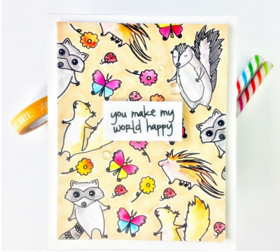
stay crafty with a blog named here kanan